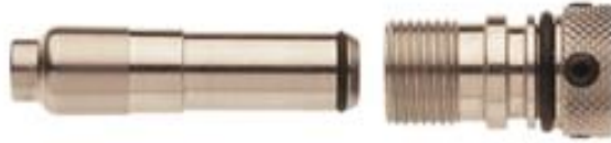
Front retainer and adjustment screws